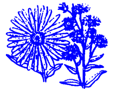
Aster frikartii flowers and how they grow: lavender-blue with yellow centers.