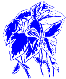
Goutweed, or Bishopís-weed*

Goutweed ( Aegopodium podagraria ãVariegatumí) 45 cm tall, spacing 30 cm. Also called Ground Elder. Bright green and white foliage. Sun or shade.