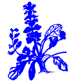
Ajuga, or Bugleweed